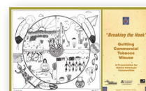
Native American Adapted Flipchart: Breaking the Hook